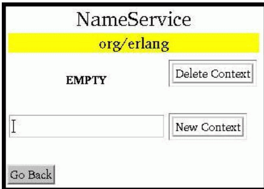
Figure 12.6: Delete Context.

If a context does not contain any sub-contexts or object bindings, it is possible to delete the context. If these requirements are met, a Delete Context button will appear. A completion status message will be displayed after deleting the context.