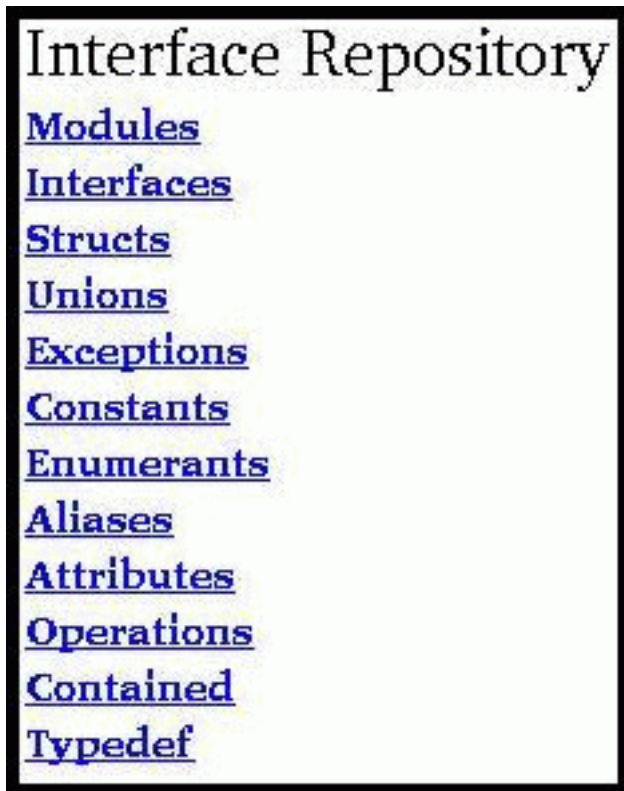
Figure 12.3: Select Type.

After selecting a type all definitions of that particular type will be displayed. If no such bindings exists the table will be empty.