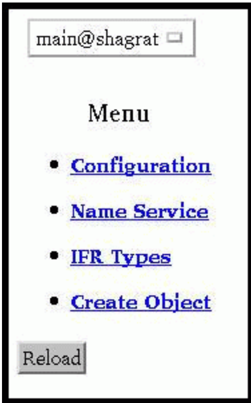
Figure 12.1: The Menu Frame.

Which nodes we can access is determined by what is returned when invoking [node() | nodes()] . If you cannot see a desired node in the list, you have to call net_adm:ping(Node) . But this requires that the node is started with the distribution switched on (e.g. erl -sname myNode ); this also goes for the node OrberWeb is running on.